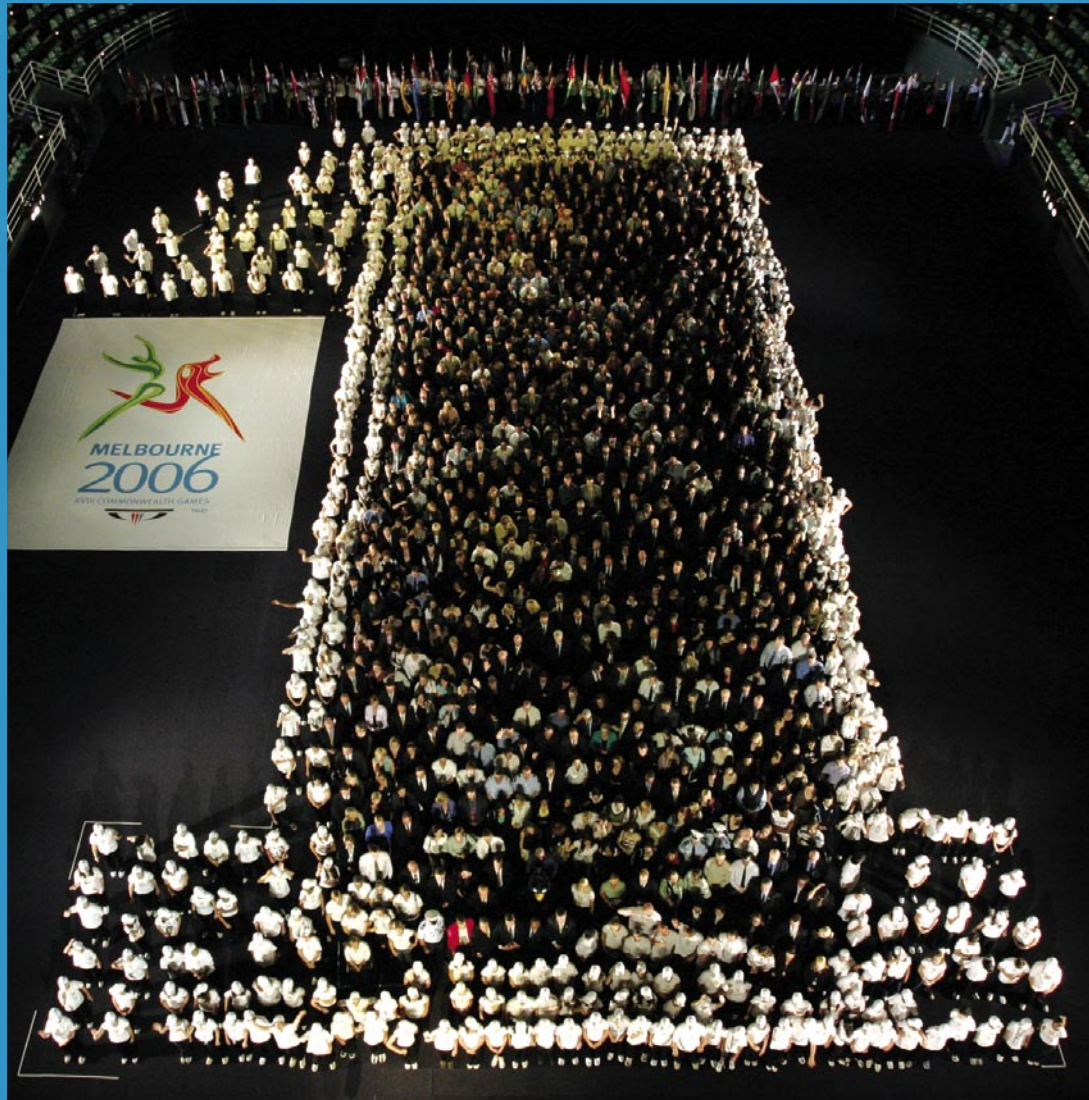
Above: More than 1000 stakeholders gather at Rod Laver Arena to celebrate the milestone. Participants included athletes, sponsors, emergency service workers and government representatives.

The Melbourne 2006 Commonwealth Games 'family' celebrated one year to go until the Opening Ceremony of the Melbourne Games by creating a giant '1' at Rod Laver Arena on March 15.