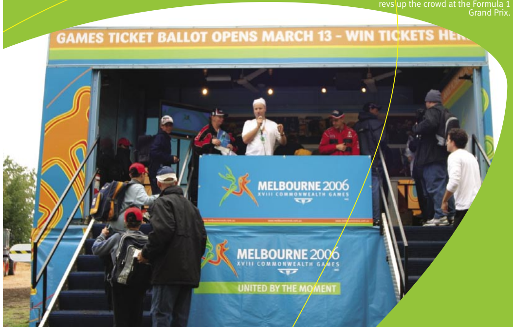
Below: The Event Attack showcase revs up the crowd at the Formula 1 Grand Prix.

Everyone who visited the Event Attack van were given the opportunity to sign up an e-newsletter, meet Karak, the Games mascot and the chance to win exclusive Games tickets and merchandise.