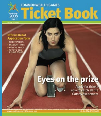
Above: The M2006 Ticket Book with Jana Pittman on the cover.

"The Ticket Ballot is a great result for everyone and ensures all Australians have equal chance of getting the seats they want to the events they want to see," Mr Bracks said.