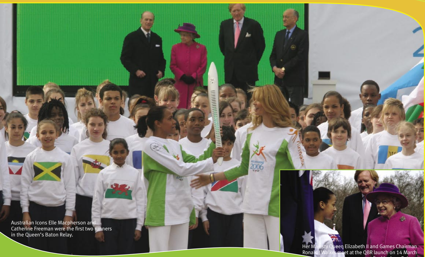
Australian Icons Elle Macpherson and Catherine Freeman were the first two runners in the Queen's Baton Relay.