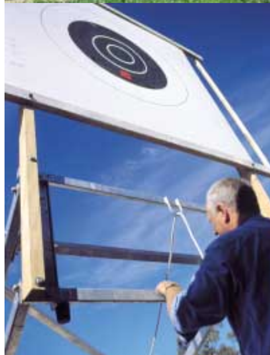
Top: The updated Wellsford Rifle Range hosted its first competition and received warm praise from spectators and participants.